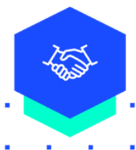
Managed Employee Collaboration

We source, configure, and deploy hardware and software from a wide portfolio of leading vendors. We also provide procurement consulting, software licence management, technology disposal and asset management services.